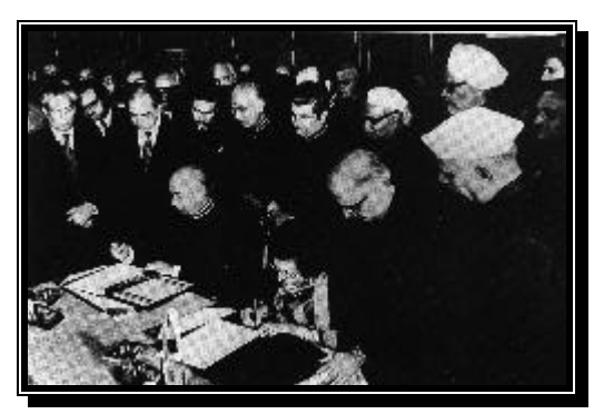
The Prime Minister of India and the President of Pakistan signing the Shimla Agreement.

1. The Government of India and the Government of Pakistan are resolved that the two countries put an end to the conflict and confrontation that have hitherto marred their relations and work for the promotion of a friendly and harmonious relationship and the establishment of durable peace in the subcontinent, so that both countries may henceforth devote their resources and energies to the pressing task of advancing the welfare of their peoples.