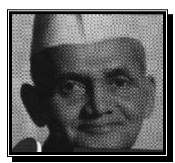
Lal Bahadur Shastri

The Prime Minister of India and the President of Pakistan, having met at Tashkent and having discussed the existing relations between India and Pakistan hereby declare their firm resolve to restore normal and peaceful relations between their countries and to promote understanding and friendly relations between their peoples. They consider the attainment of these objectives of vital importance for the welfare of the 600 million people of India and Pakistan.